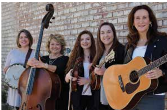
Sweet Potato Pie All-Female Bluegrass Band