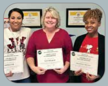
Pictured are three winners from Maysville Elementary.

Jones-Onslow EMC recently awarded 70 Bright Ideas Grants totaling $75,000 to local educators. These grants fund unique classroom learning projects that will benefit close to 28,000 students at 51 schools in Jones and Onslow Counties and the Topsail Area of Pender County.